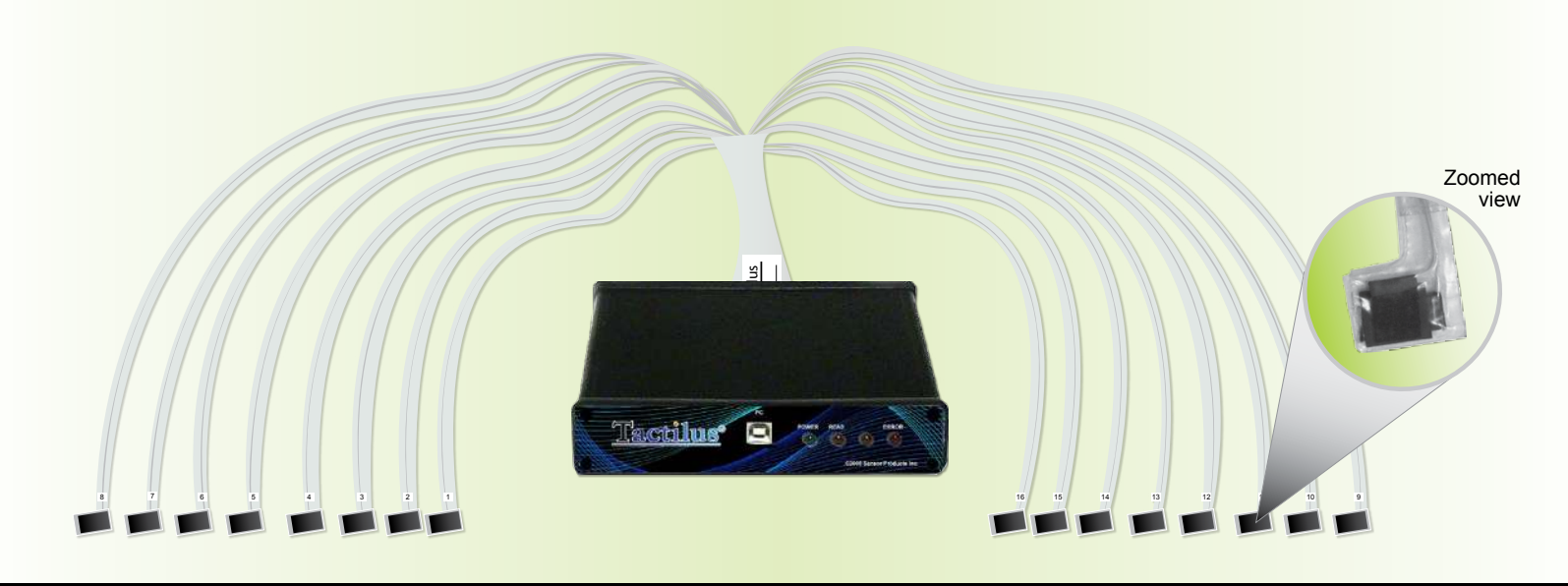
The Tactilus Free Form® sensor system