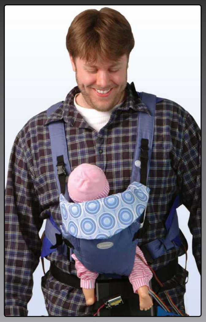
Tactilus Free Form® sensor system in action