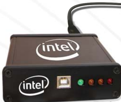
Electronics are clearly marked with your identity

We create lasting idenia and brand extensions. Sensor Products is dedicated to perpetuating and extending your brand and corporate identity. Actions that cultivate and broaden your firm's presence and market-perceived expertise. By comprehensively embedding your corporate identity throughout our product offering you are further building your brand equity.