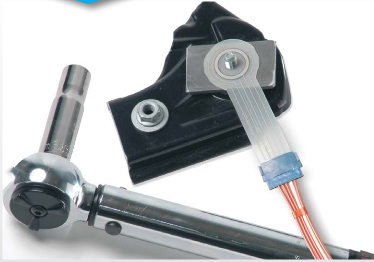
Tactilus® pressure indicating washer sensor on bolted interface