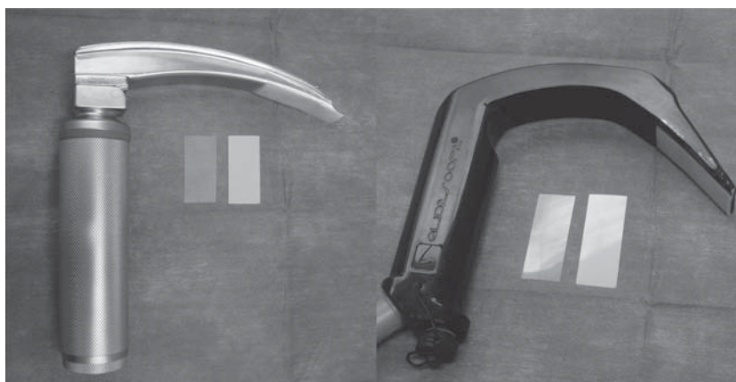
Fig 1 Positioning of the film transducers on the tips of the laryngoscope blades.

blade: while the Macintosh blade has a slight curvature, by which a correct alignment of the three anatomical axes is performed through the application of a high force, the GlideScope blade does not require a big effort, as the pronounced curvature angle allows to direct almost immediately the point of view towards the glottis.