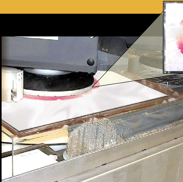
Encased Fujifilm Prescale® positioned under a wafer polishing head