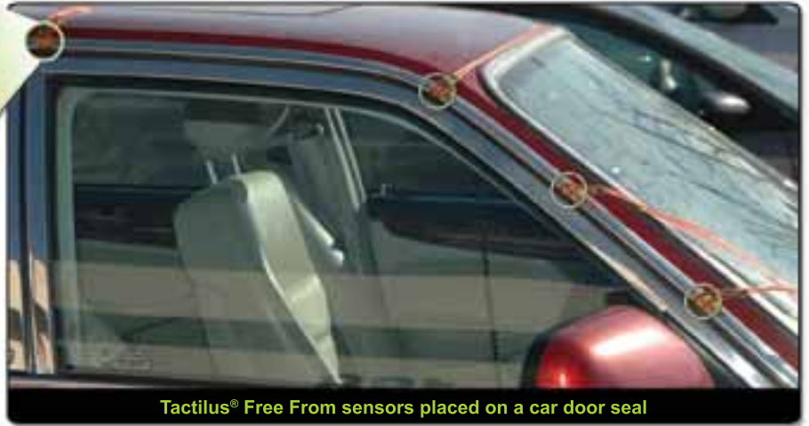
Tactilus® Free From sensors placed on a car door seal