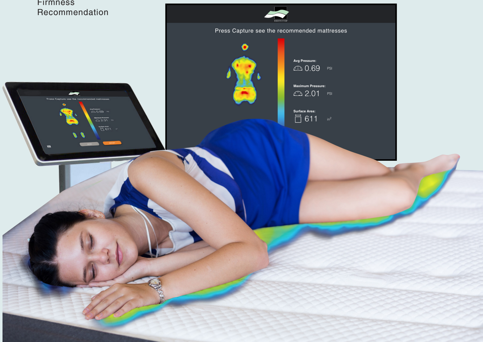
Retail Mattress Pressure Profiling System