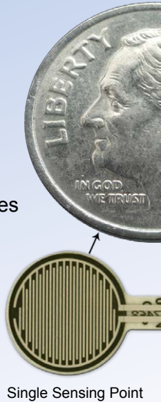
Single Sensing Point

Unique to the industry, each Free Form sensor element is individually calibrated, sequentially serialized and quality tested to ensure the highest repeatability and accuracy. In addition, our sensor assemblies feature ergonomic and high quality Berg connectors, ensuring durable interconnection.