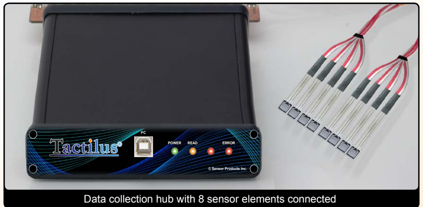
Data collection hub with 8 sensor elements connected