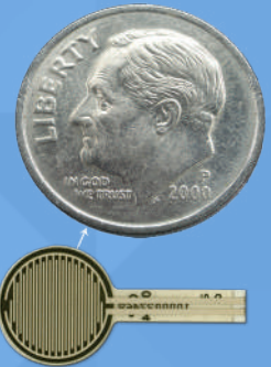
The Tactilus Free Form sensors can be made extremely small

Perform tests to gather data on your process, part or design with zero user training.