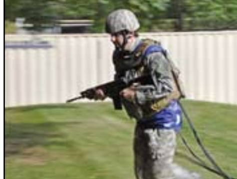
Soldier Being Tested with Tactilus® Sensor System

A: Tactilus® is a sensor system developed by Sensor Products Inc. that reacts like an electronic skin. When placed anywhere on a soldier's body underneath body armour and a backpack it produces a body map which pinpoints areas of greater pressure that may cause pain or strain. The system records data several times per second, so it can be used to test the effectiveness of different body armour prototypes as soldiers go through manoeuvres. Tactilus® can also be used to record the magnitude of impact on composite fibres.