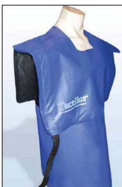
Torso Sensor Fixed on a Mannequin

The system is so intuitive that virtually anyone who can use and interpret an Excel spreadsheet and a very basic graphics system can understand it. Tactilus® is light weight and portable. It is equipped with a hub that can be accessed through wireless if desired expanding its reach and utility.