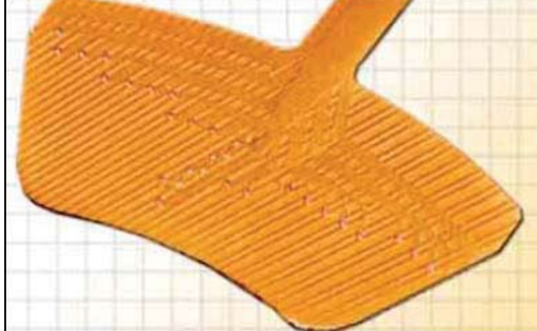
Tactilus® Brake Shoe Surface Sensor

A: Purchasing Tactilus® is a very small investment which yields enormous benefits. The average soldier wears thousands of dollars worth of body armour and equipment. Tactilus® is a solution that often costs around $20,000+ that can improve the comfort and tactical ability of virtually any soldier who wears body armour. Even if the project is more complex, in the case of body armour the fact that you can save lives as a result of this technology makes it a very small investment.