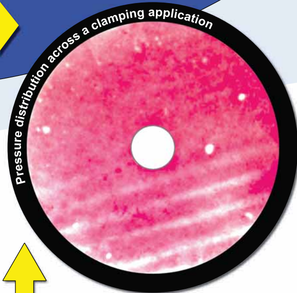
Fuji Prescale® film BEFORE Topaq® Analysis

The Topaq® advanced pressure analysis system extracts statistical data and detailed digital visuals from Fuji Prescale®. The results are a wealth of statistical information and high resolution pseudo-color images. This enhanced optical imaging analysis greatly enhances the ability and usability of film, Topaq® defines pressure distribution and magnitude in a variety of outputs.