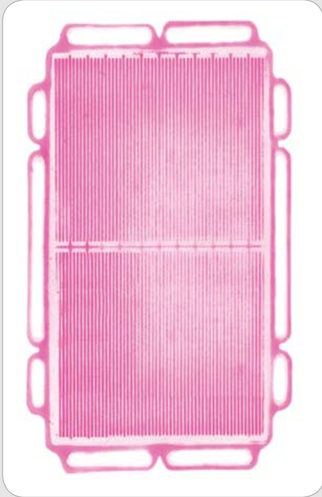
1 Pressure Image BEFORE Topaq® Analysis