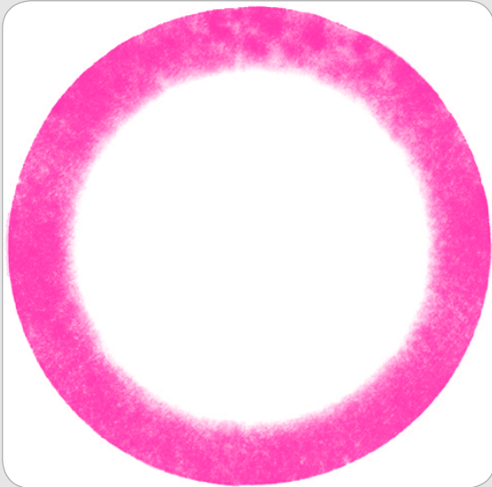
1 Pressure Image BEFORE Topaq® Analysis