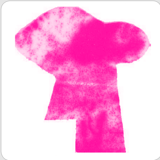
1 Pressure Image BEFORE Topaq® Analysis