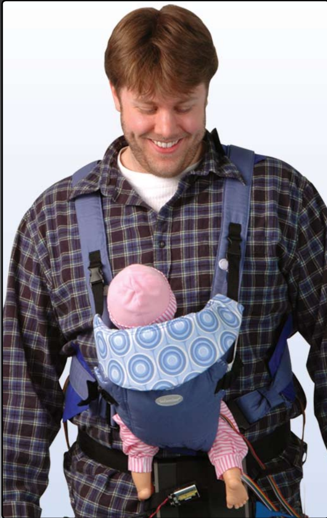
Tactilus Free Form® sensor system in action