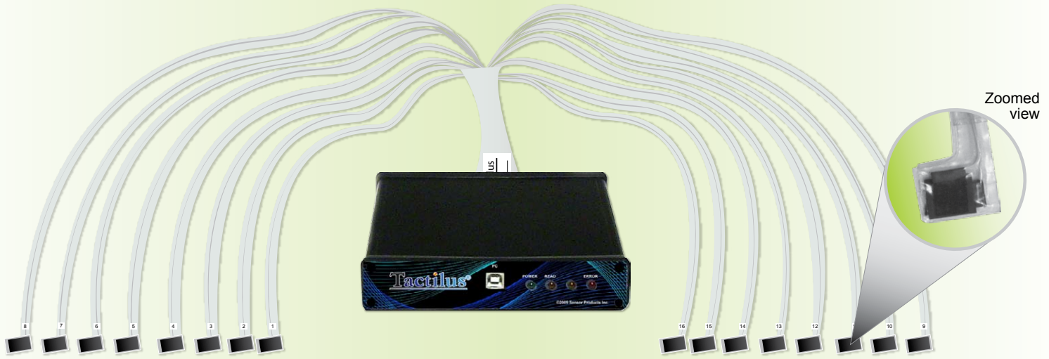
The Tactilus Free Form® sensor system