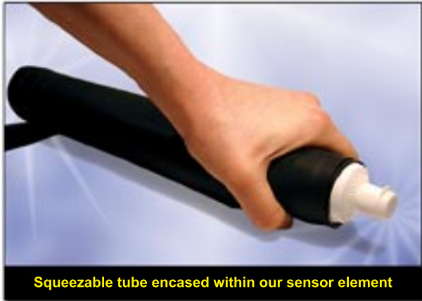
Squeezable tube encased within our sensor element