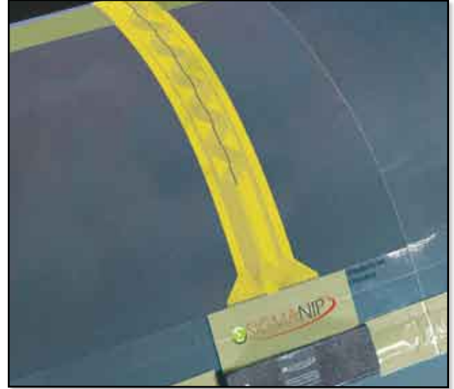
Close up view of single sensor element