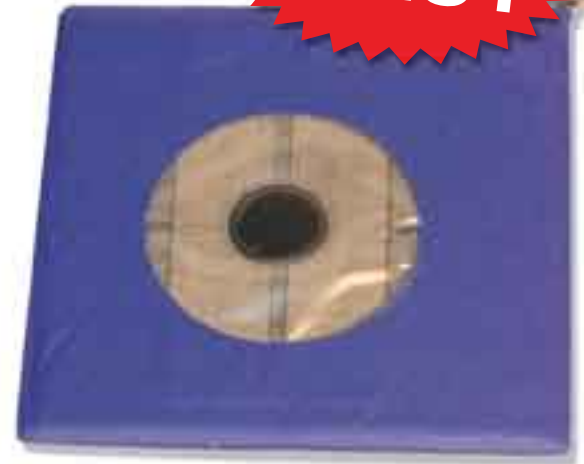
Shear sensor element