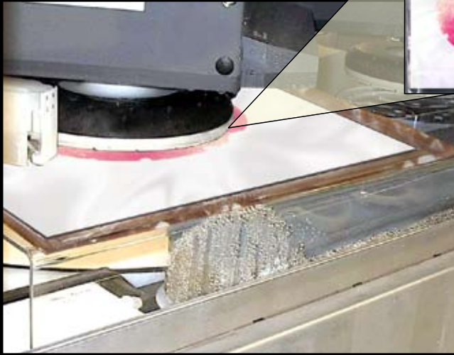
Encased Pressure x ® film positioned under a wafer polishing head