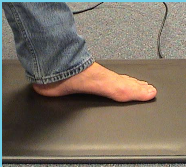
THE TACTILUS® FOOT PLATE SENSOR

How Tactilus® Works: The Tactilus® sensor element instantly collects pressure data and sends it as an analog signal back to an intermediary data “hub,” where it is converted to a digital signal. The digital signal is then sent to an interface (software) configured for easy viewing and dynamic analysis capabilities. Tactilus® software provides 2-D, 3-D, isobar and pinpoint region-of-interest image viewing, graphical displays of data in bar charts, line scans and histograms, statistical analysis of average/minimum/maximum pressures, total force over any selected area, pressure vs. time and more. The data can easily be exported for further analysis in many third party softwares.