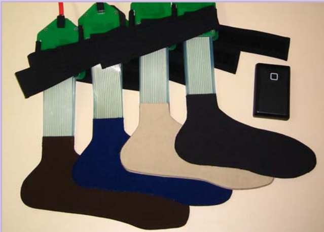
The Tactilus® foot insole sensor, to be inserted into shoe