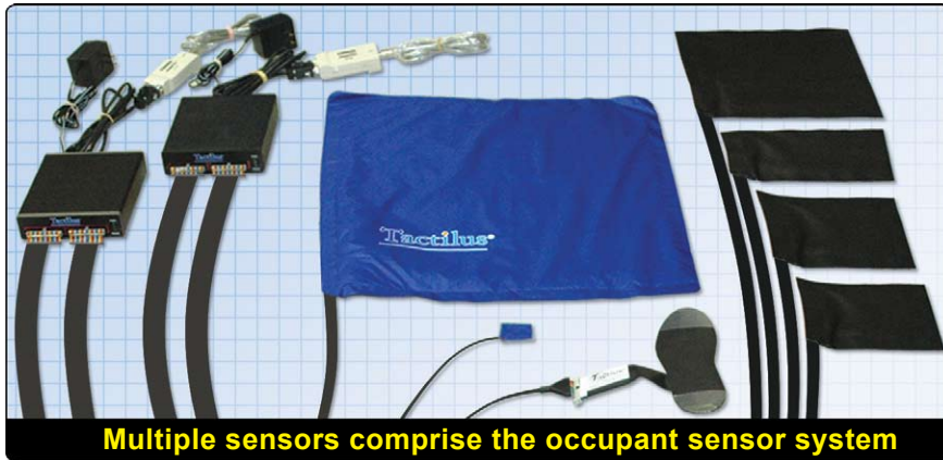
Multiple sensors comprise the occupant sensor system

Engineers can simultaneously measure multiple forces applied by an automobile occupant and collect the data in real time. Tactilus® software is essentially a dashboard control panel that assimilates the pipeline of data into comprehensible and easily interpretable images - all on one screen at the same time.