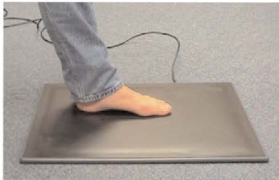
TACTILUS® FOOT PLATFORM ©2015 SENSOR PRODUCTS, LLC 2015

Employing userfriendly software, the foot platform and insole sensor systems generate indepth statistical information and dynamic 2D and 3D profile images for such medical and ergonomic body mapping needs as diabetic and neuropathic patient screening, orthotic and prosthetic efficacy profiling, pronation/supination impact evaluation during bipedal locomotion activities, pre and postsurgical comparative analysis, ulceration detection, degenerative foot disorder monitoring, ray hypermobility diagnosis, and early scoliosis detection. With unprecedented speed and accuracy, the systems comprehensively profile plantar pressure distribution and magnitude.