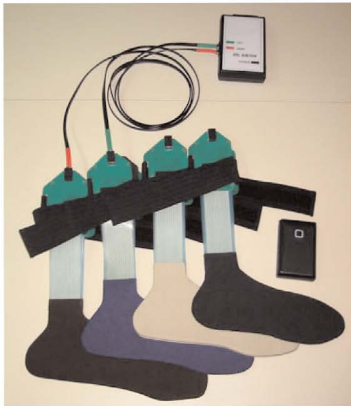
TACTILUS® INSOLE SYSTEM HARDWARE

For instance, diabetes is the fifth major cause of disease related deaths in the United States. Of the estimated 18.2 million Americans affected, 4.5 million will suffer from plantar problems like degenerative foot disorder and complications due to neuropathy such as bunions, hammertoes, Charcot feet and more. Experts on the disease stress comprehensive foot care for amputation prevention and overall comfort for diabetes sufferers. Orthotic devices and appropriate footwear play a large role in the quality of life for these patients.