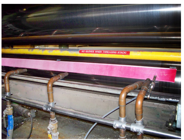
Pressurex® reveals variations in nip contact pressure which can be easily quantified.