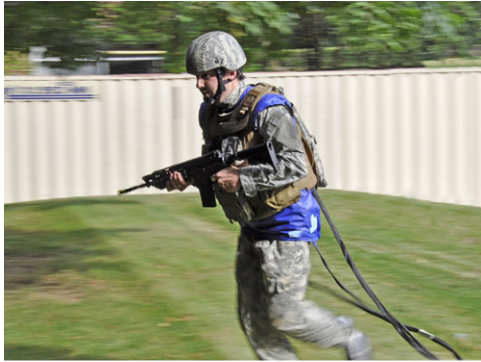
Soldier running in a field being tested with sensor system

“The challenge for us in sensor technology was to modify our sensors and software to conform to the dimensions of a vest, while providing full three-dimensional pressure distribution visibility of the chest, back and neck,” says Blume.