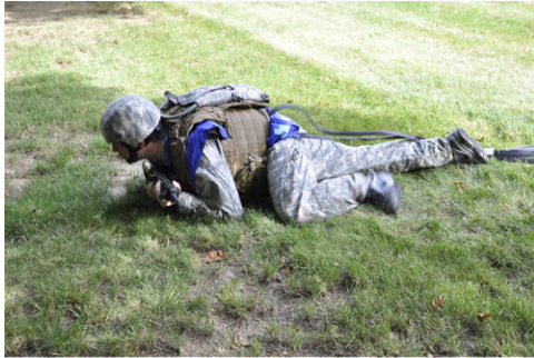
Soldier crawling wearing vest, body armor and blue sensor pads

Credit Given to Partnership of New Sensor Technology and Human Factors Engineering