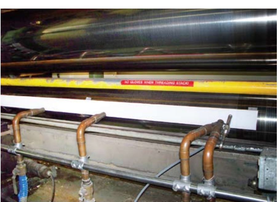
Pressurex® is placed on the roller at Mohawk Fine Papers before closing the nip.

When placed between contacting rollers, the sensor film instantaneously and permanently changes colour directly proportional to the actual pressure