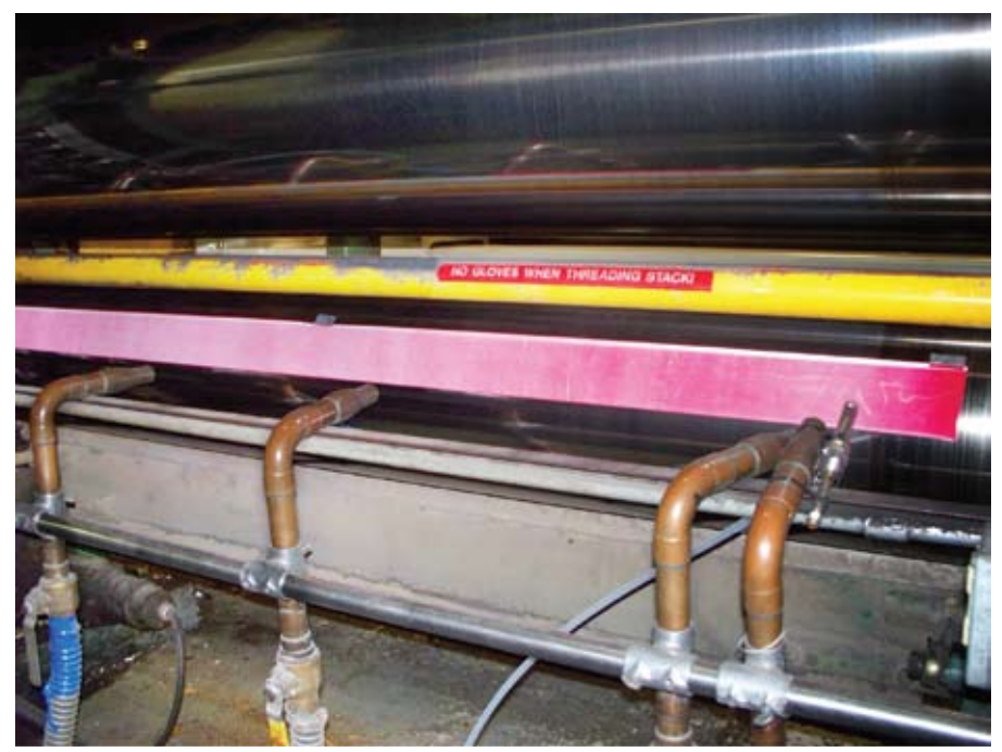
Pressurex® reveals variations in nip contact pressure which can be easily quantified.